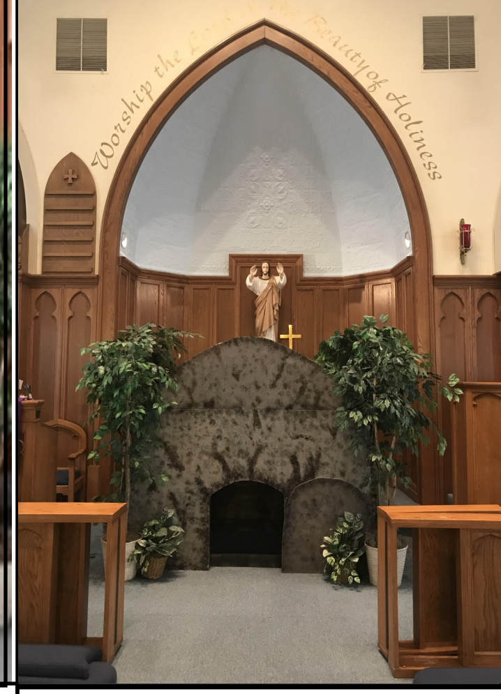
Jesus was buried in Joseph's tomb