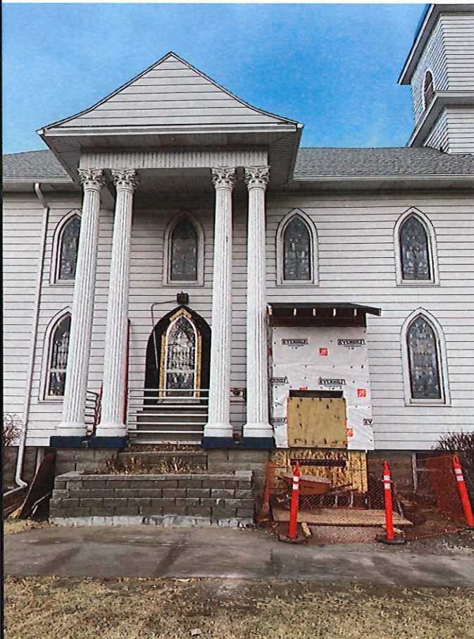
Street view of the continued lift construction