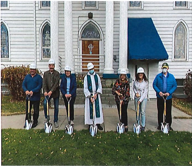
Ground Breaking Ceremony