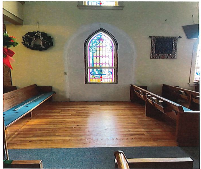
Stained Glass Window Moved to new location