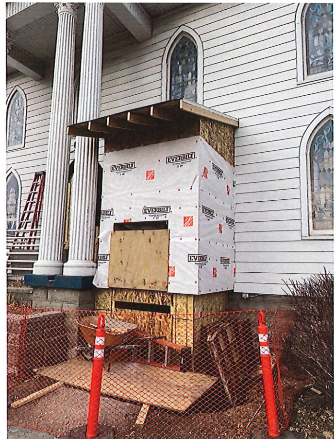
Close up view of the continued lift construction