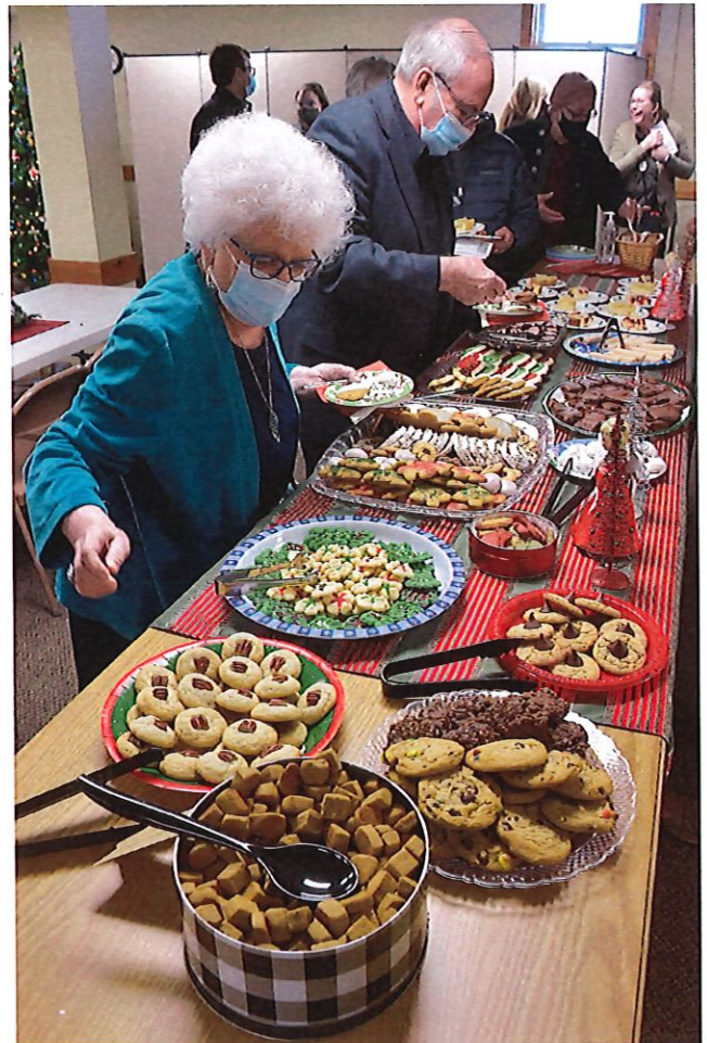
German refreshments following the service furnished by ladies of the congregation.